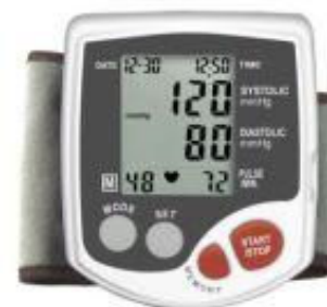
Reprinted with permission from PCRM

Let your doctor know you are concerned about your blood pressure and want to use foods to help bring it under control. High blood pressure is dangerous, so, let your doctor guide you as to when and if your need for medication has changed.